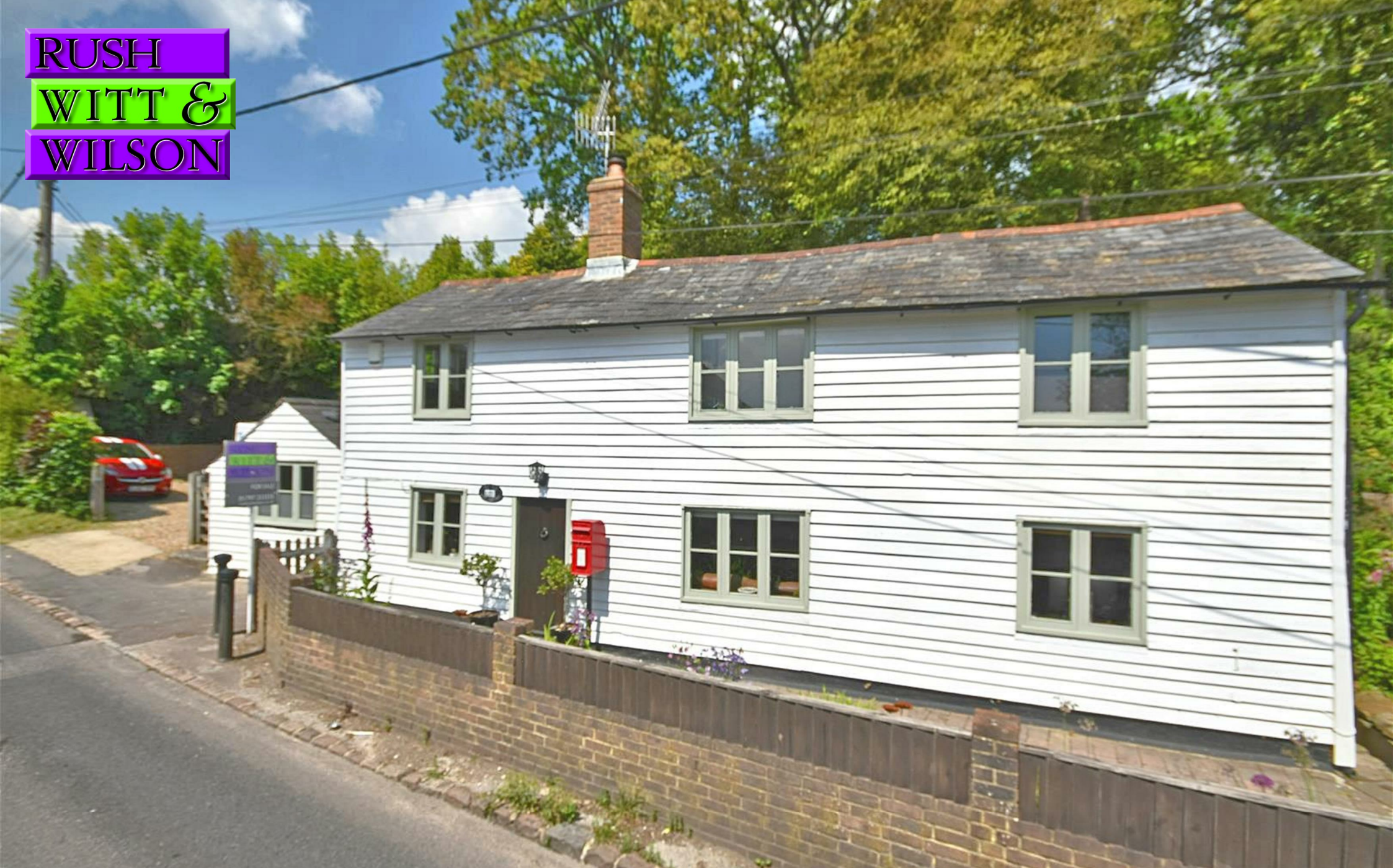
Old Post Cottage, Cackle Street, Brede, East Sussex, TN31 6EA. £450,000 Freehold